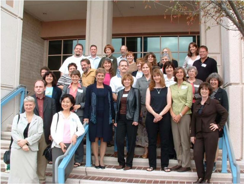
TESOL 2006 & 2007 Planning Committees met in Tampa on January 21, 2006