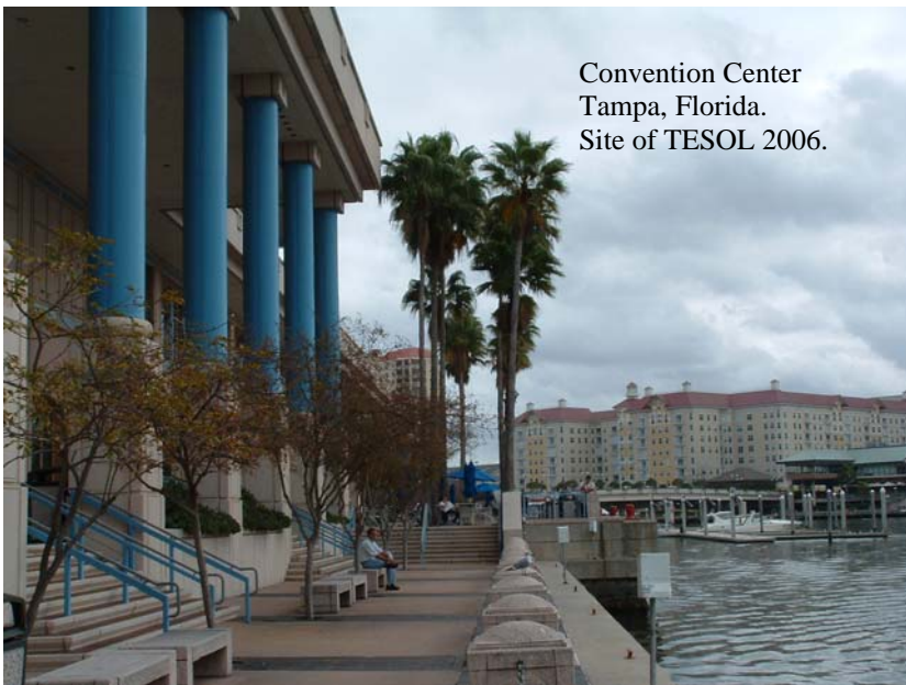
Convention Center Tampa, Florida. Site of TESOL 2006.

If you are going to Tampa, Florida for the TESOL 2006 Convention, help us represent Washington. WE NEED YOUR HELP!